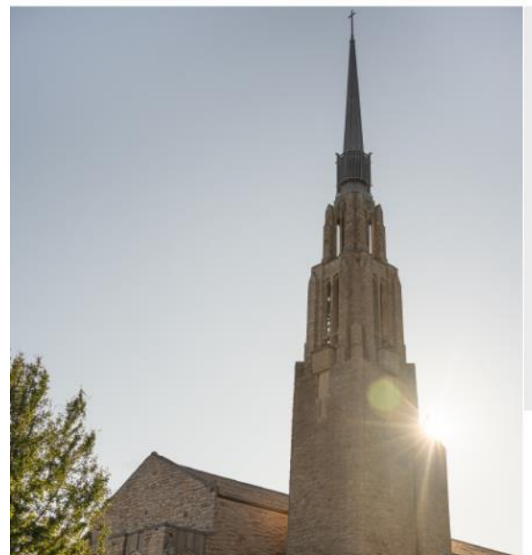
Sunday, May 18<sup>th</sup> 9:00 - 10:30 a.m. Fellowship Hall