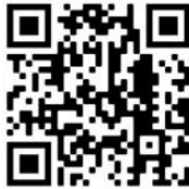
FBC Visitor Information

Scan this QR code to complete our guest information form electronically. Or, you may fill out the form on the back of this order of worship and place it in the basket in the narthex.