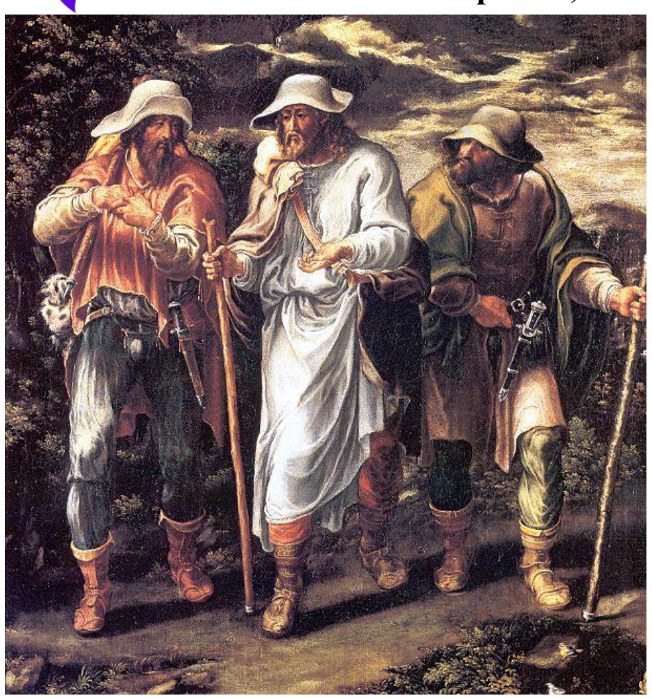
"Walk to Emmaus"

1560-1565 Lelio Orsi (1511-1587) National Gallery (Great Britain), London, England